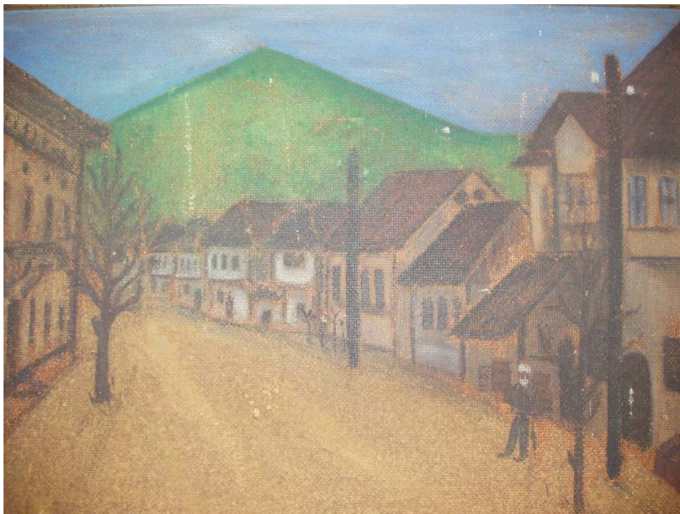
Fig. 2- Old painting of Visoko Town showing a perfect pyramidal shape of VISOČICA Hill.